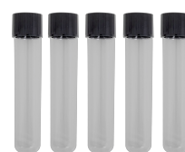
Glass test tubes 18mm BS-050102-NK

Glass Test Tubes 18x100mm, high borosilicate, PP Cap with silicone pad. Packing - 100 pcs/box