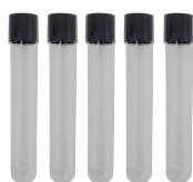
Glass test tubes 16mm BS-050102-MK

Glass Test Tubes 16x100mm, high borosilicate, PP Cap with silicone pad. Packing - 100 pcs/box